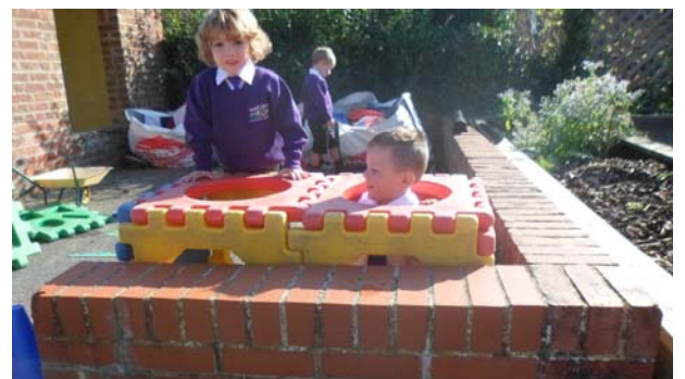
Caterpillars at work and play...