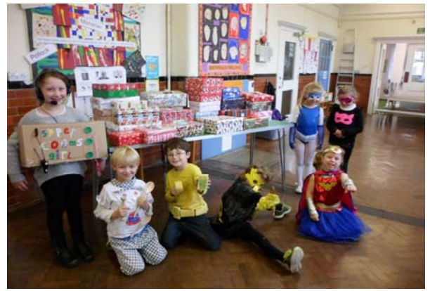
What a combination - superheroes and their Christmas shoeboxes!