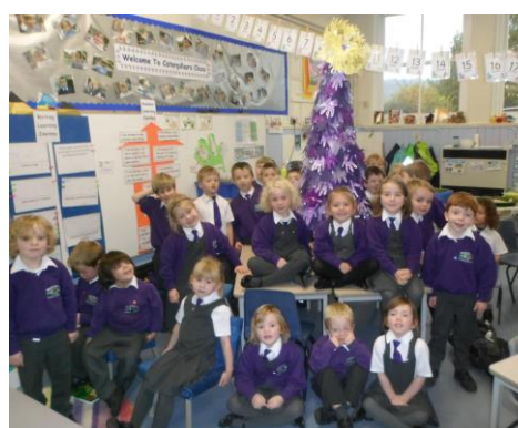
Caterpillars putting the finishing touches to the North Downs 'tree'...