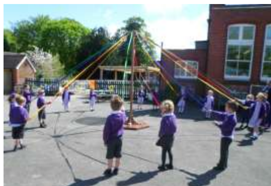
Ahead of Maypole Day, Thurs 24 th May, enjoy these photos of Caterpillars dancing in the sunshine!