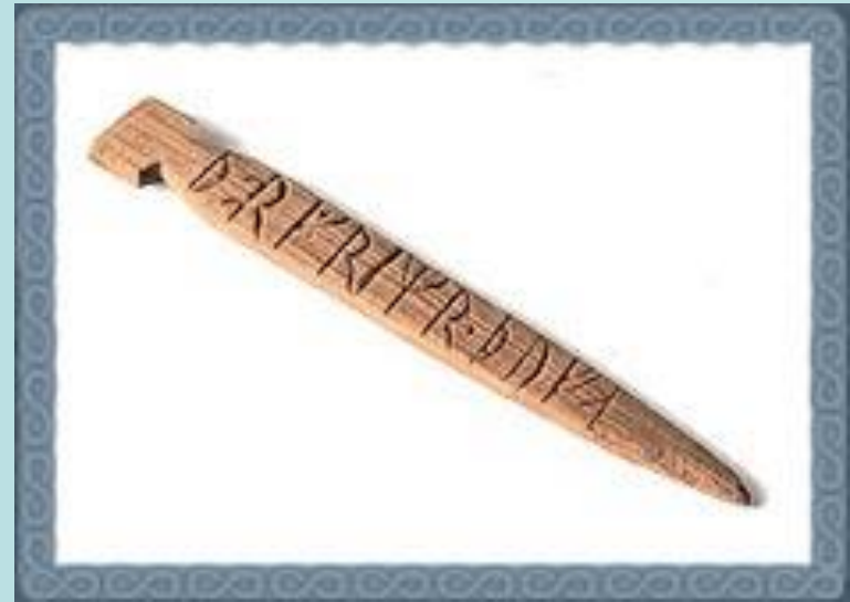
Wood tag identifying property, reading "Thorgrim's pile"

They were also used by merchants to keep records of items bought and sold.