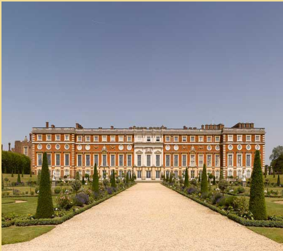
South Front of Hampton Court Palace.

Sir Christopher Wren re-built the south front of Hampton Court. Do you notice how similar it is to the Palace of Versailles?