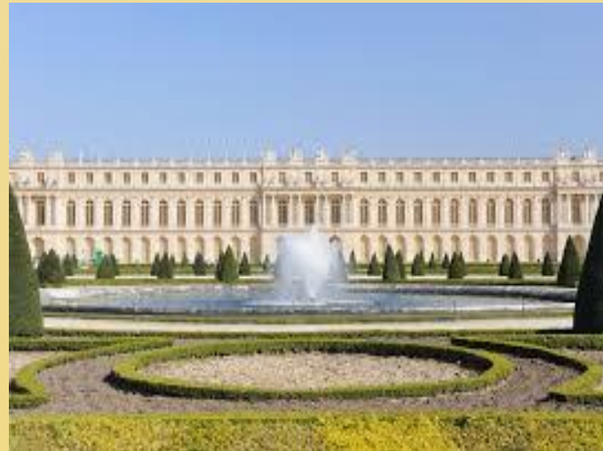
Palace of Versailles