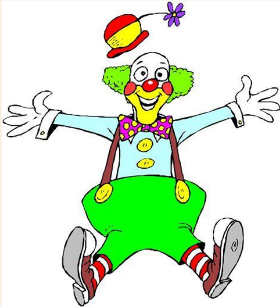
The funny clown

Adjectives have the power to only describe nouns .