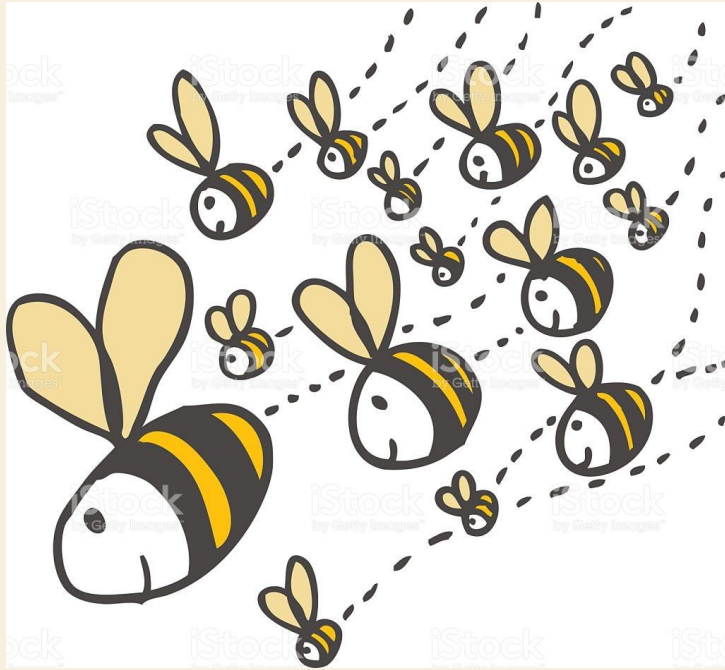
Swarm of bees

Collective nouns are the names given for a group.