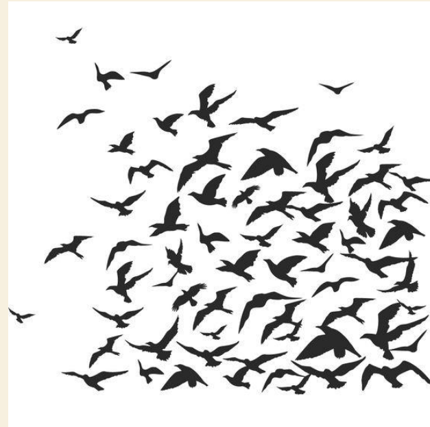
Flock of birds