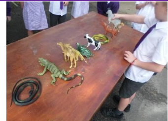
Counting within 10