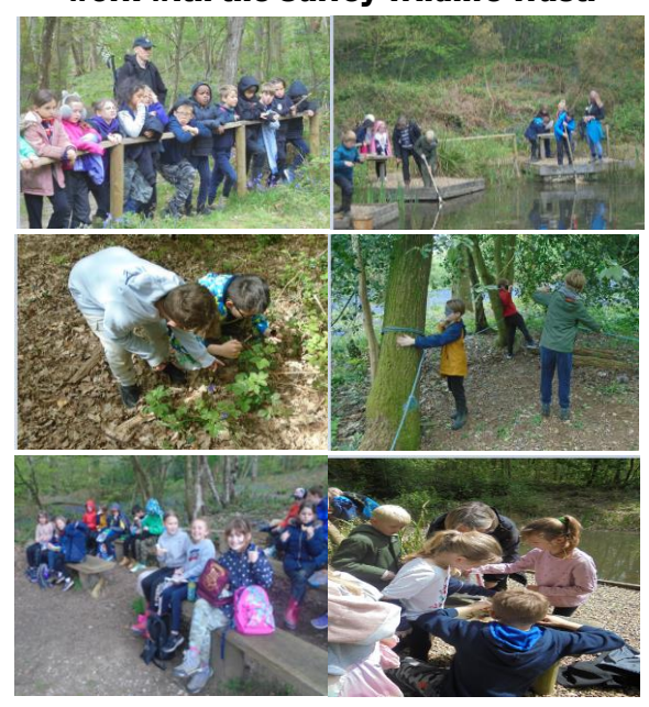
WHAT A FANTASTIC DAY!

Last week Year 4 had a fantastic trip to Nower Wood to continue their brilliant work with the Surrey Wildlife Trust.