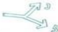
(IF MEMBERS TURNED) LEFT, 5 RIGHT)