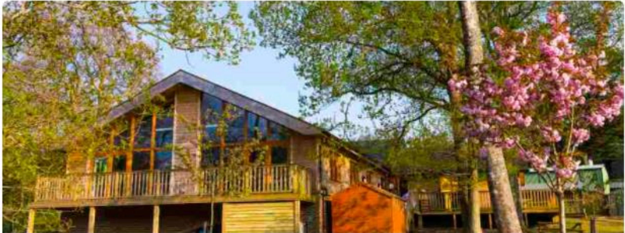
The main centre at High Ashurst